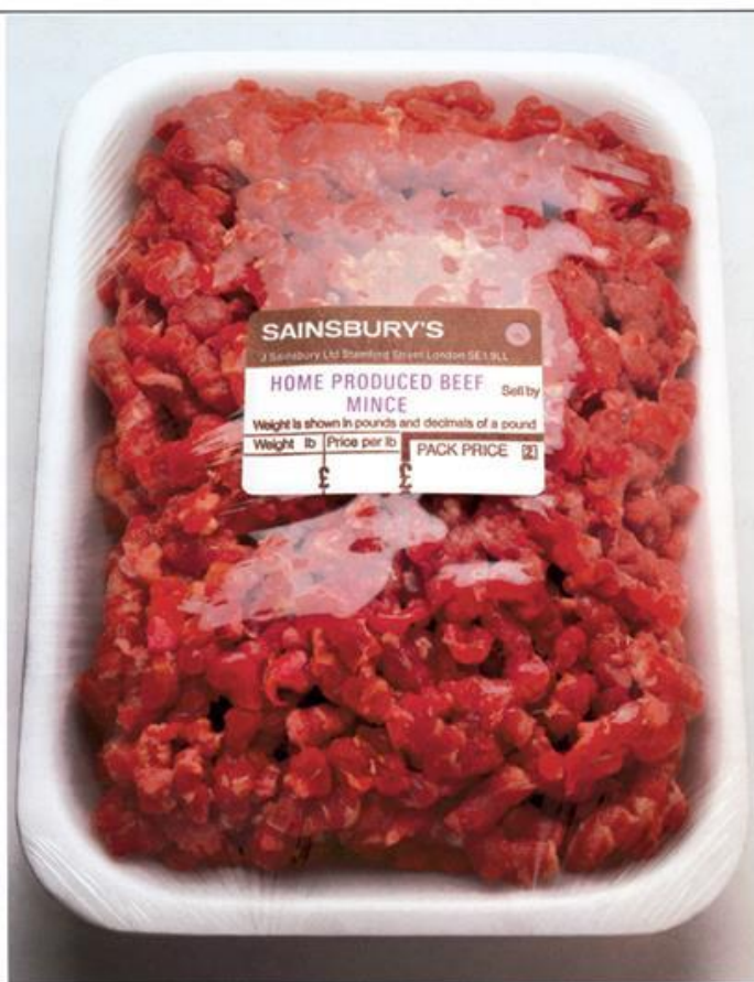
Figure 3: Meat. Sainsbury's, The Sunday Times , 1980s [exact date unknown], [unknown page]. Cited in Paul Burke, 'How Sainsbury's Ads Revolutionised the UK's Food Culture', Campaign , 17 October 2016 < https://www.campaignlive.co.uk/article/sainsburys-ads-revolutionised-uks-food-culture/1412027 > [accessed 12 January 2018]

Not even for a day. Good food costs less at Sainsbury's.